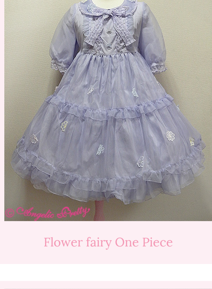
Flower fairy One Piece