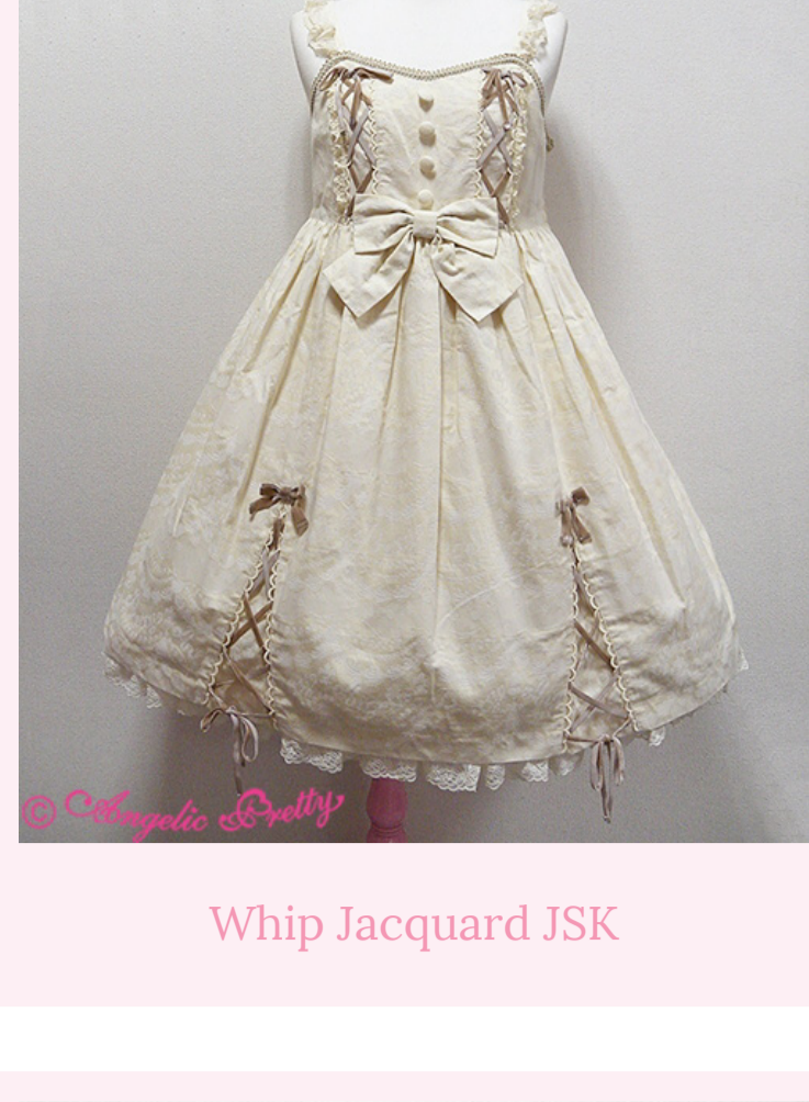
Whip Jacquard JSK