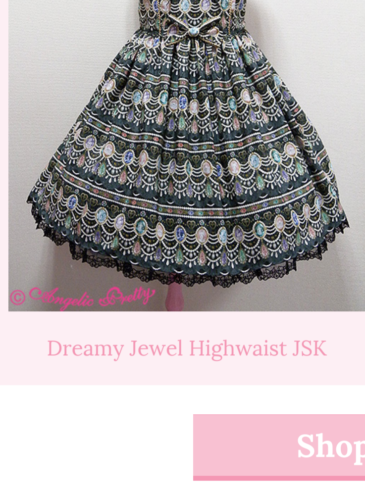
Dreamy Jewel Highwaist JSK