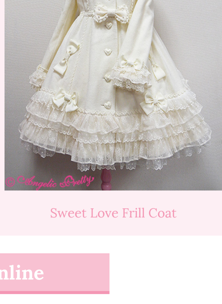
Sweet Love Frill Coat